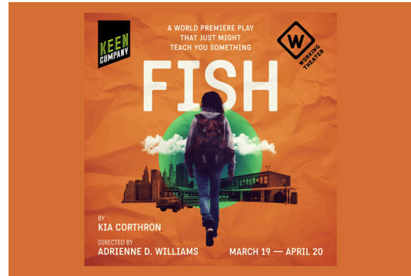
Fish , a play written by Kia Corthron '92 and co-produced by Keen Company and Working Theater, is showing at Theatre Row until April 20, 2024.