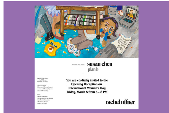
Plan B , a solo exhibition by Susan Chen '20 is on view until April 20, 2024 at Rachel Uffner Gallery.