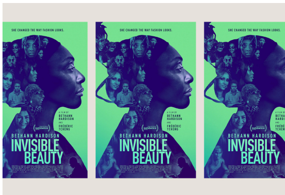
Invisible Beauty , co-written & co-directed by Frédéric Tcheng '07 , is now streaming on Hulu.