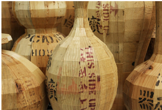
Vivian Chiu '19 is an exhibiting artist in This Side Up , a group exhibition at the Houston Center for Contemporary Art that will showcase until May 4, 2024. (Photo: Vivian Chiu)